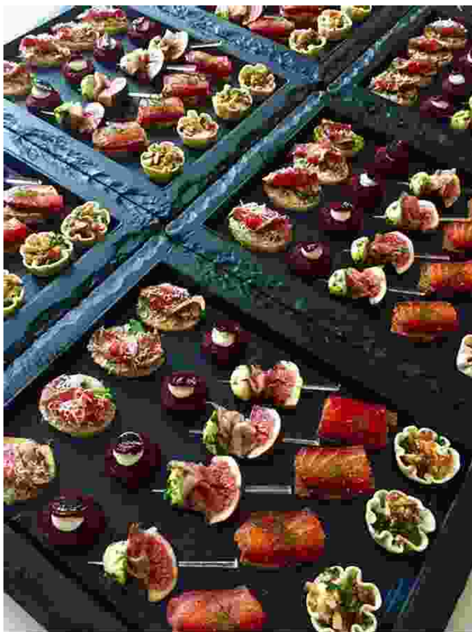
Party-Pleasing Hors d'Oeuvres

Kick off your culinary journey with an array of elegant canapes that will set the tone for a sophisticated and memorable event. From classic crostini topped with creamy goat cheese and fig compote to delicate blinis adorned with smoked salmon and dill creme fraiche, these bite-sized marvels will delight your guests with their exquisite flavors and refined presentation.