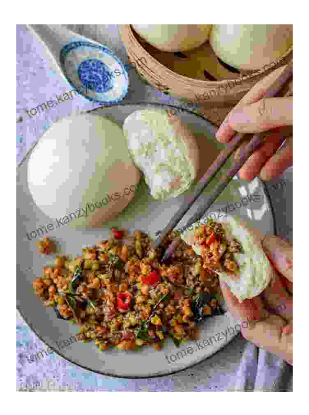
Chapter 4: Culinary Canvas: Decorating Your Mantou Masterpieces

buns. Learn the secrets of shaping intricate folds, creating delicate pleats, and achieving the perfect golden-brown crust. Discover the nuances of steaming, a culinary technique that preserves the delicate texture and enhances the flavors of your buns. With step-by-step instructions and inspiring examples, you'll master the art of creating steamed buns that are as beautiful to behold as they are delicious to savor.