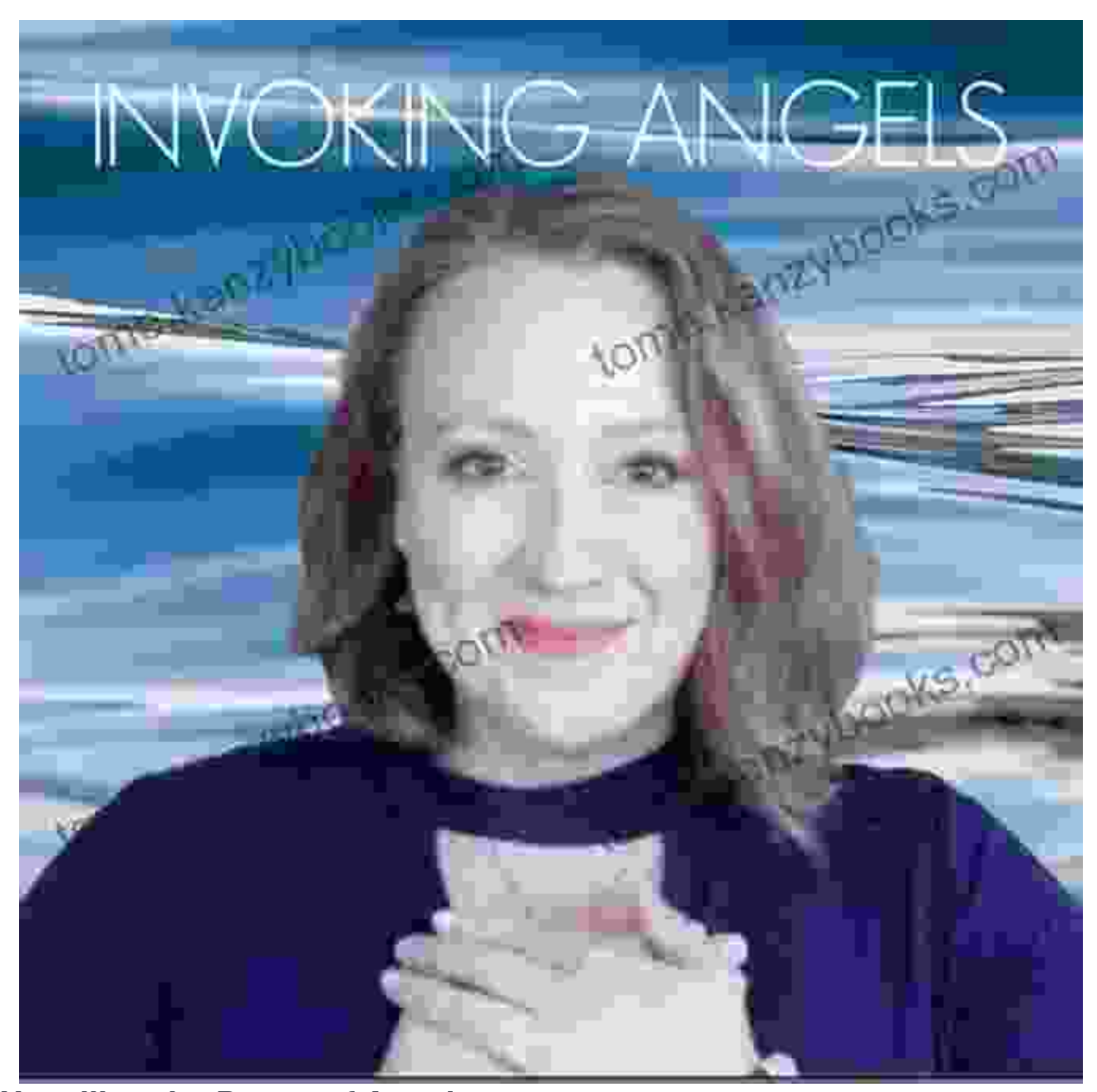
Unveiling the Power of Angels

Ewing invites you to transcend the boundaries of the physical world and delve into the ethereal presence of angels. Through her captivating narratives and profound insights, you'll discover the extraordinary abilities of these celestial beings. Learn how to connect with your guardian angels, understand their divine messages, and harness their power to create positive change in your life.